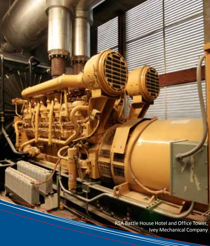
RSA Battle House Hotel and Office Tower, Ivey Mechanical Company