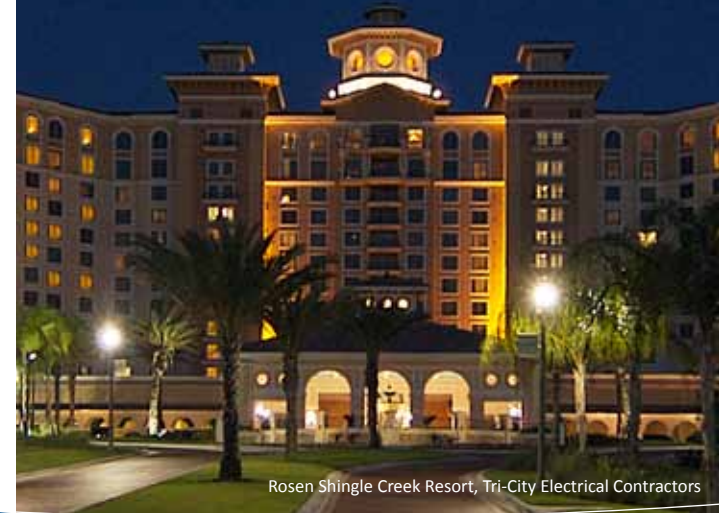
Rosen Shingle Creek Resort, Tri-City Electrical Contractors