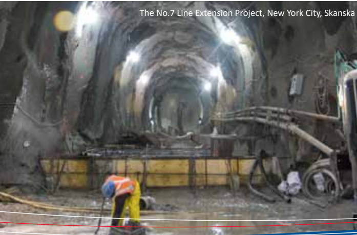
The No.7 Line Extension Project, New York City, Skanska