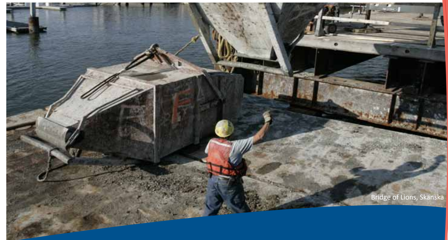
Bridge of Lions, Skanska

© 2011 Computer Guidance Corporation. All Rights Reserved.