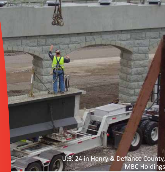
U.S. 24 in Henry & Defiance County