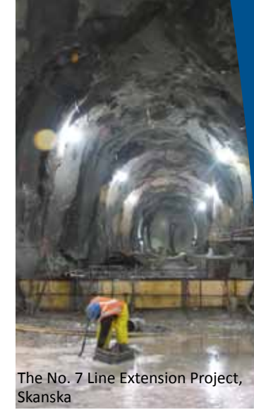
The No. 7 Line Extension Project, Skanska

Leading heavy highway and civil contractors are leveraging technology solutions to enhance the productivity and efficiency of their teams—both at the field level and in the office. Now is the time to make technology work for you.