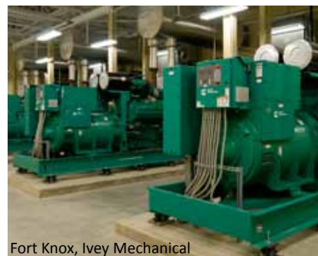
Fort Knox, Ivey Mechanical

Access your business-critical information on demand to support decision-making and performance evaluation.