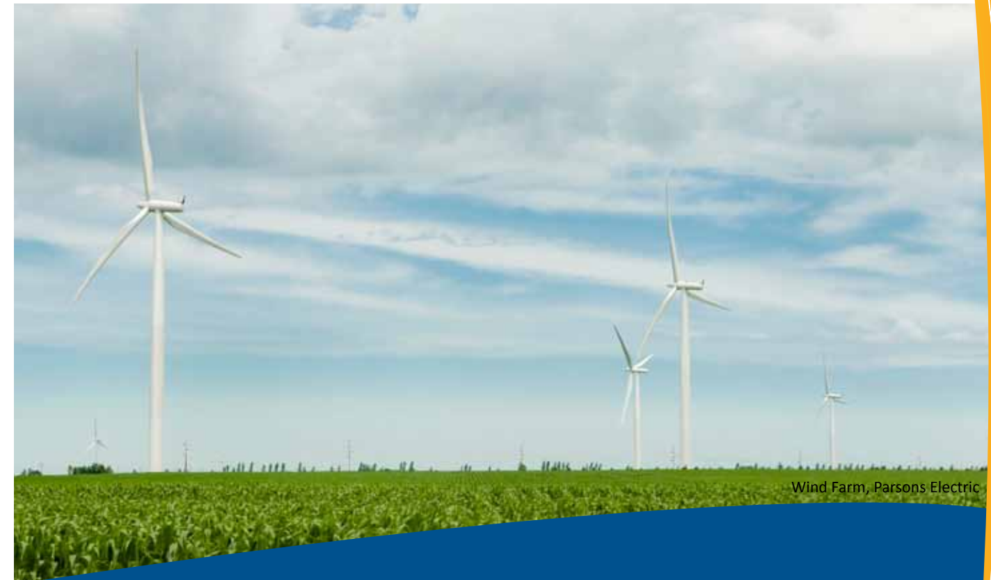
Wind Farm, Parsons Electric

888.361.4551 sales@computerguidance.com www.computerguidance.com