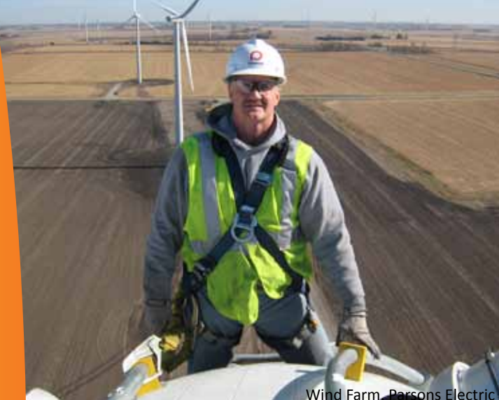
Wind Farm, Parsons Electric