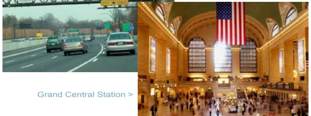
Grand Central Station >