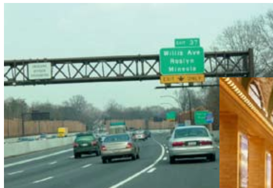
< Long Island Expressway

Yonkers now has the ability to access immediate, detailed and precise job cost and accounting information which has resulted in more accurate planning, forecasting and decision making. Since the information is now accessible through an intuitive browser-based graphical user interface, real-time job cost information is easily viewed anywhere by project managers, executives and the accounting staff.