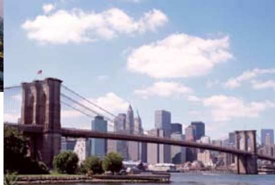
Brooklyn Bridge >