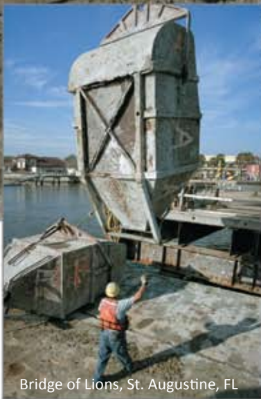
Bridge of Lions, St. Augustine, FL