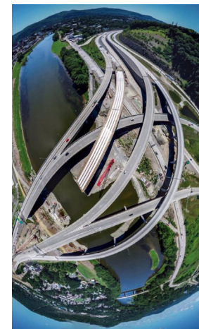
Highway Construction in the State of New York

(all saving amounts calculated as $45 per hour)