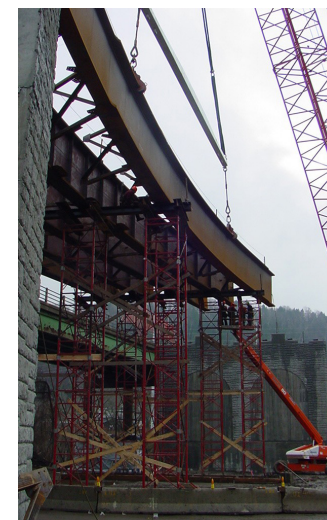
Highway and Bridge Construction in the State of New York