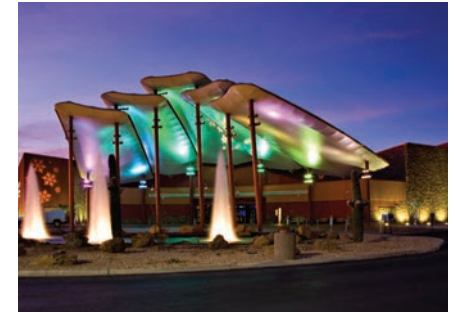
Lone Butte Casino, Chandler, AZ